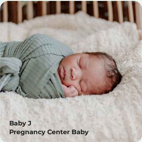
Baby J Pregnancy Center Baby

The landscape of abortion has changed. In Ohio, most abortions are now done through the abortion pill with medication abortions increasing 47% from 2024 to 2025, though the abortion rate has only increased 15%. Women can obtain abortion pills through clinics, telehealth providers, or online by mail.