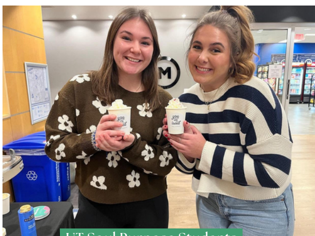
UT Soul Purpose Students

Because of our donors, these young women hear the message that God has far better plans for them than they can every imagine. We hope they hear it over and over again. When our young women grasp this truth, they can confidently turn to God and follow his plans for their lives.