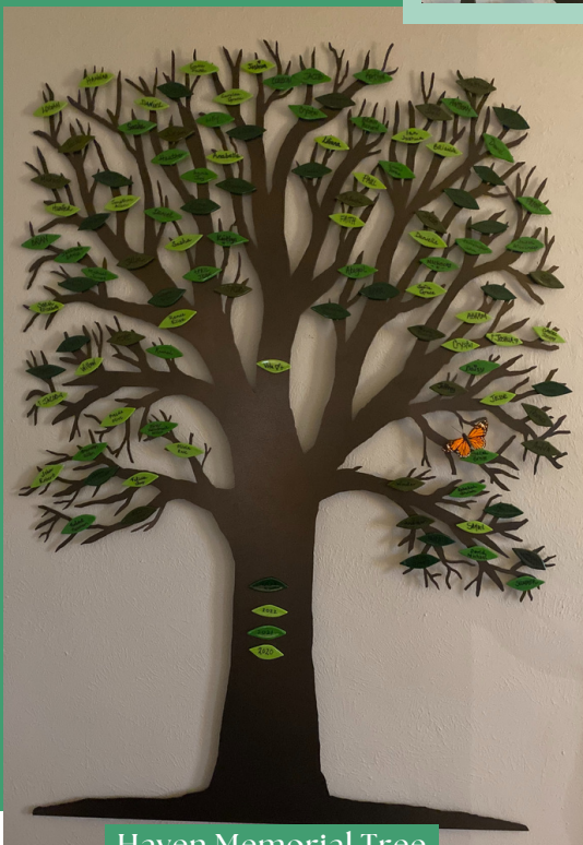
Haven Memorial Tree