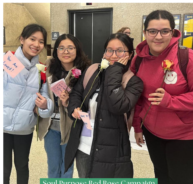
Soul Purpose Red Rose Campaign